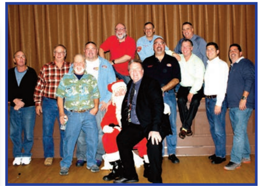
The President and part of his team which make this club what it is today