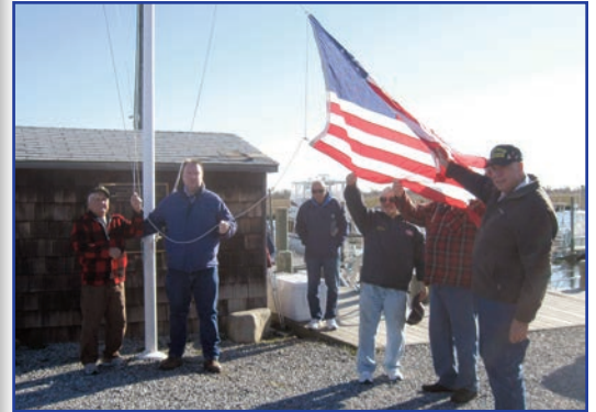
A Salute to all Veterans at our Flag Raising Ceremony