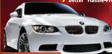
2008 M3 Coupe

HOURS OF OPERATION: Mon-Fri: 8:30am-8pm • Sat: 9am-5pm