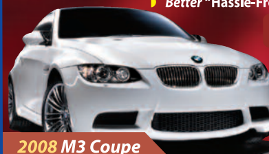
2008 M3 Coupe

HOURS OF OPERATION: Mon-Fri: 8:30am-8pm • Sat: 9am-5pm