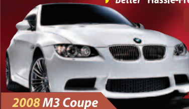
2008 M3 Coupe

HOURS OF OPERATION: Mon-Fri: 8:30am-8pm • Sat: 9am-5pm