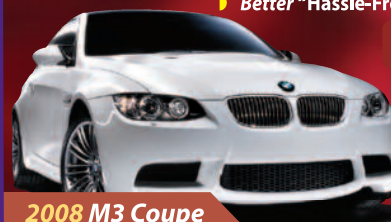
2008 M3 Coupe

HOURS OF OPERATION: Mon-Fri: 8:30am-8pm • Sat: 9am-5pm