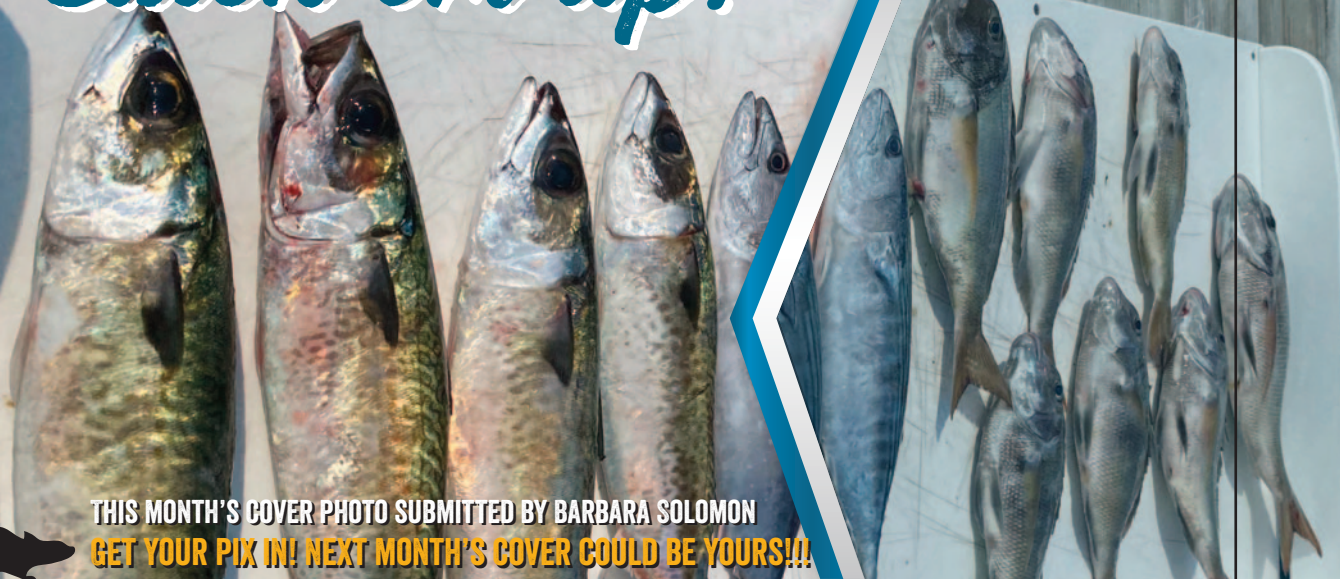
THIS MONTH'S COVER PHOTO SUBMITTED BY BARBARA SOLOMON GET YOUR PIX IN! NEXT MONTH'S COVER COULD BE YOURS!!!