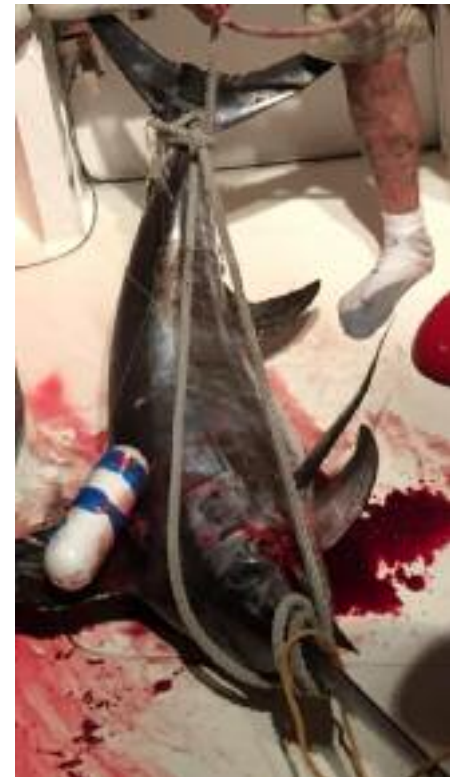
Hog Tied Sword RED DAWN style

Please email your reports to philton@optonline.net ; or text/call me at 516.721.8907. Don't forget to send pictures and catch details for consideration by the Bulletin Committee for "Catch of the Month."