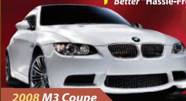
2008 M3 Coupe

HOURS OF OPERATION: Mon-Fri: 8:30am-8pm • Sat: 9am-5pm