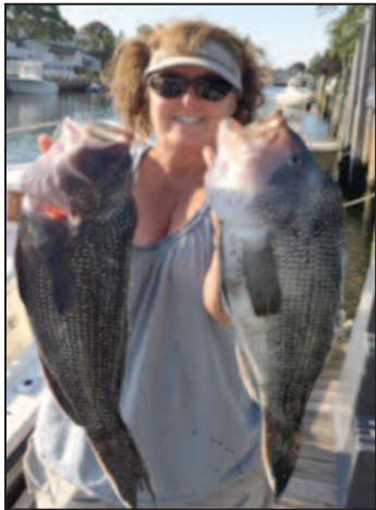
MEP Zullo - Pair of 5 LB + Seabass