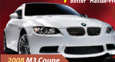
2008 M3 Coupe

HOURS OF OPERATION: Mon-Fri: 8:30am-8pm • Sat: 9am-5pm