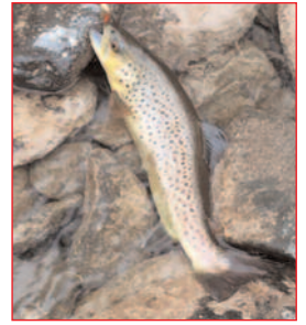
Esopus Creek Shandaken NY Brown Trout