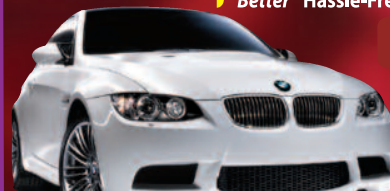
2008 M3 Coupe

HOURS OF OPERATION: Mon-Fri: 8:30am-8pm • Sat: 9am-5pm