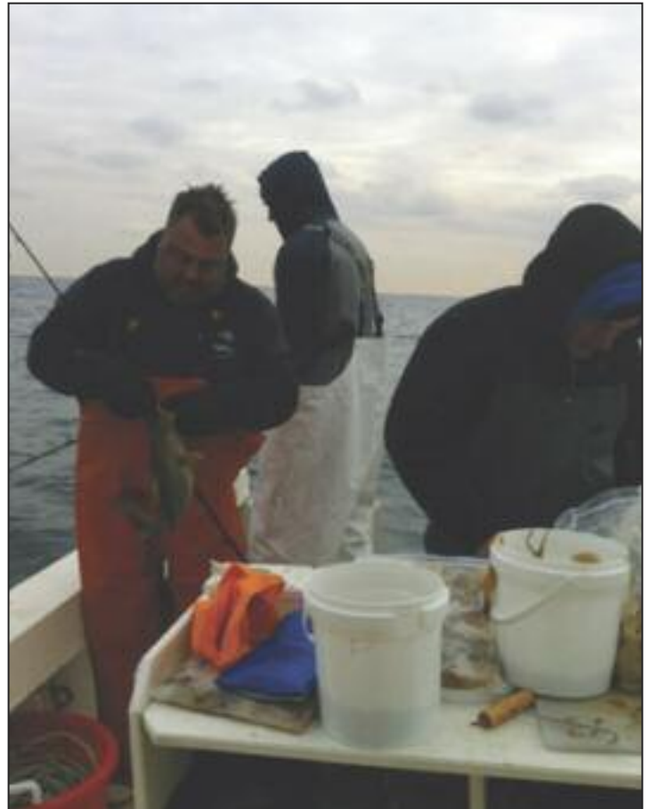
Cod Crew at Work