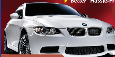
2008 M3 Coupe

HOURS OF OPERATION: Mon-Fri: 8:30am-8pm • Sat: 9am-5pm