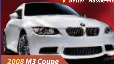
2008 M3 Coupe

HOURS OF OPERATION: Mon-Fri: 8:30am-8pm • Sat: 9am-5pm